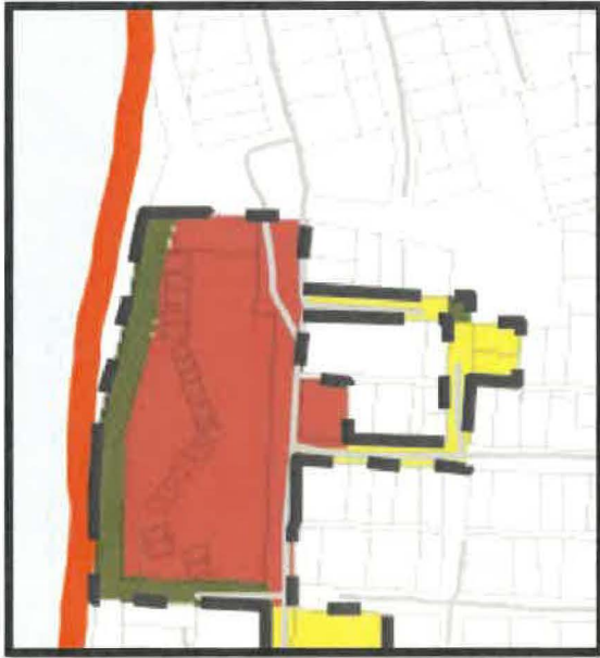
Before Proposed Rezoning