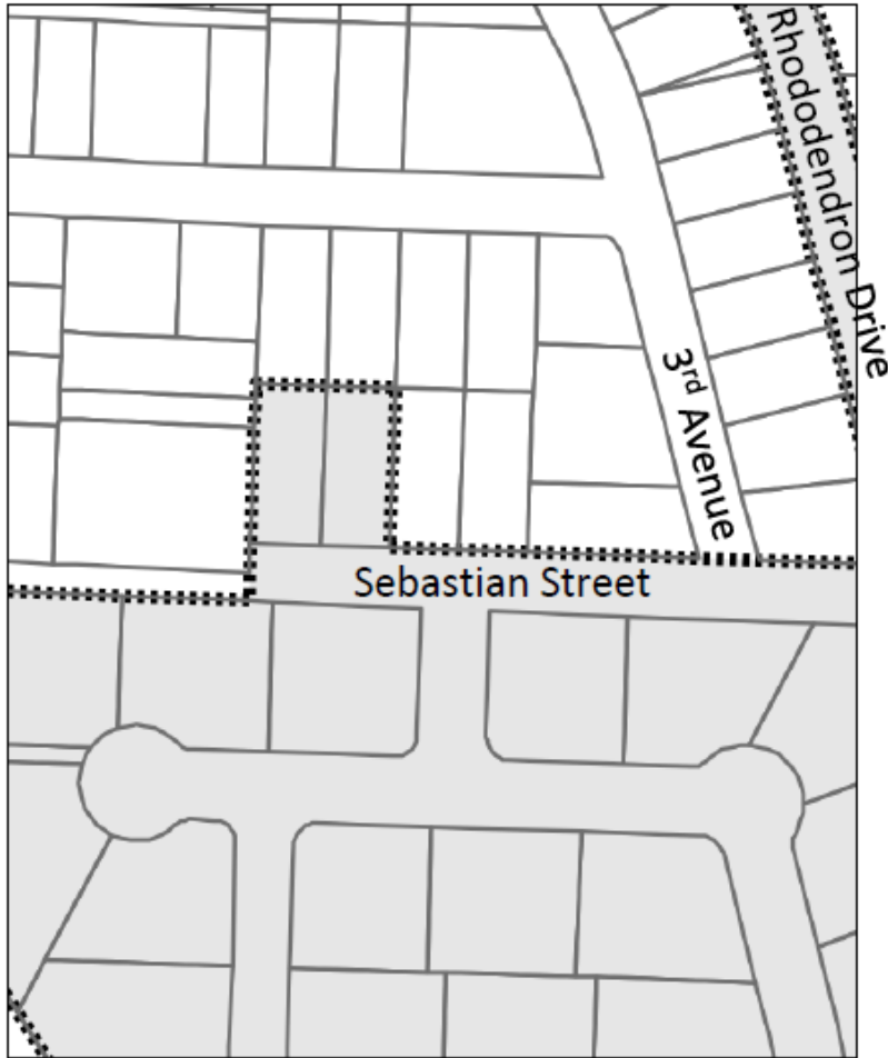
Before Proposed Annexation