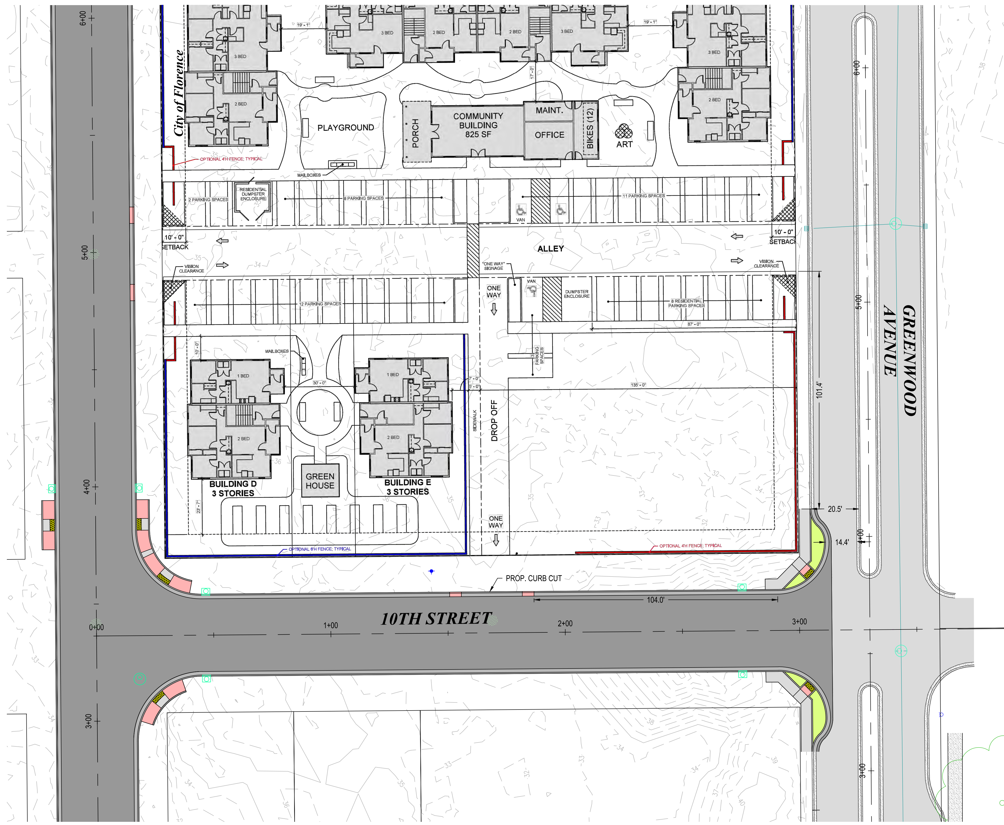
PLAN VIEW 1" = 20'