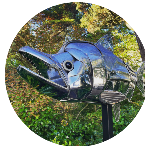
Loki - Sockeye Salmon Jud Turner Recycled Vehicle Parts Height: 66in on Metal Post Widest Points are 19 x 9in Price: $8,000