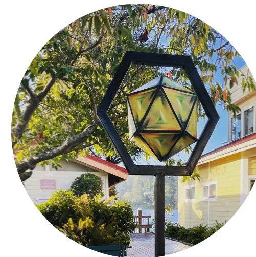
Icosahedron Kirk Seese Steel, MDF, UV Inks Height: 84in Widest Point is 36in Price: $7,500