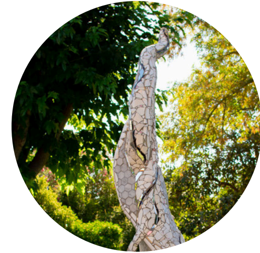
goddess Lucy Ruth Wright Rivers Recycled Materials Mosaic Height: 91in Widest Point is 28in Price: $13,500

All Art is Available for Purchase - Visit bit.ly/ArtExposedFlorence