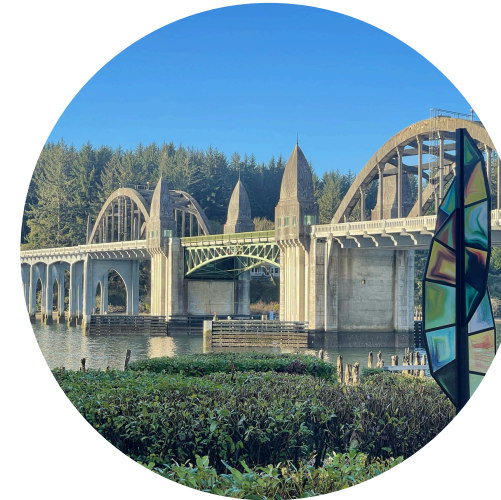
Pluma Sculptura, aka The Feather Kirk Seese Mosaic Work Height: 120in Widest Point is 22in Price: $7,500