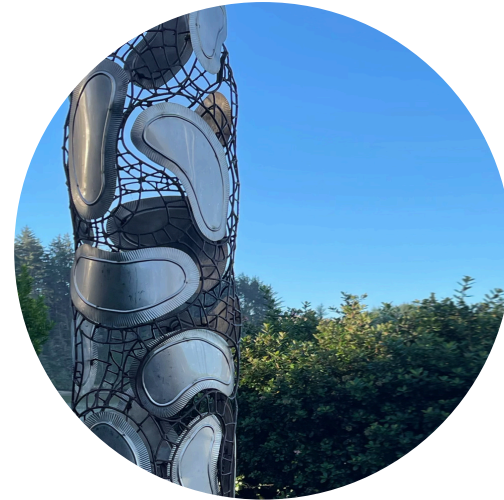
Pier 56 Rodger Squirrell Stainless Steel Height: 66in Widest Point is 22in Price: $28,700