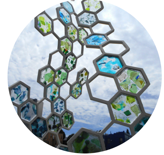
Fossil III Lin McJunkin & Milo White Stainless Steel & Cast Glass Height: 80in Widest Point is 20in Price: $4,500