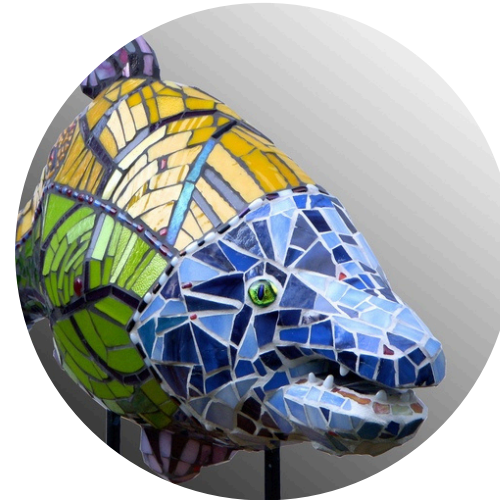
Glam-y Salmon Mark Brody Mosaic Work Height: 26in on Metal Posts Widest Points are 12 x 44in Price: $3,800