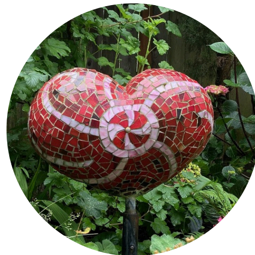
Heart in the Garden Mark Brody Mosaic Work Height: 22in on Metal Post Widest Points are 19 x 9in Price: $1,100