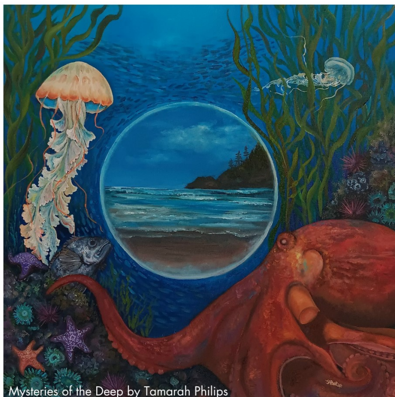
Mysteries of the Deep by Tamarah Philips