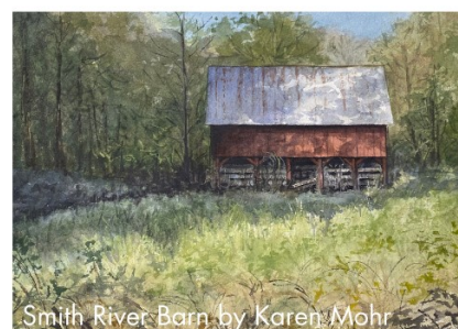
Smith River Barn by Karen Mohr

As the sun stretches its golden fingers across the sky and the world blooms in a kaleidoscope of colors, we invite you celebrate the essence of summer through artists creations.